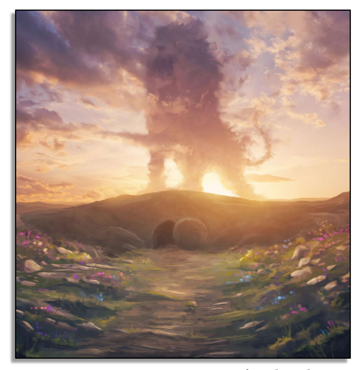
Peace in the chaos

Our Savior Lutheran Church, Troutville, Virginia April 14, 2024 10 a.m.